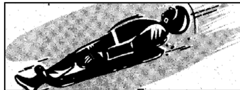
What is this person doing?!

This newsletter is printed on recycled stock..